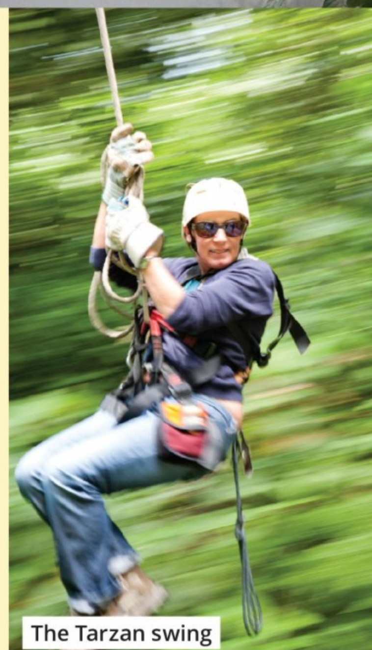
The Tarzan swing

Now here we are in Costa Rica. Today we rode on the Monteverde Extremo and the Tarzan swing. They were really frightening , but a great thing to do! I recommend them to everyone.