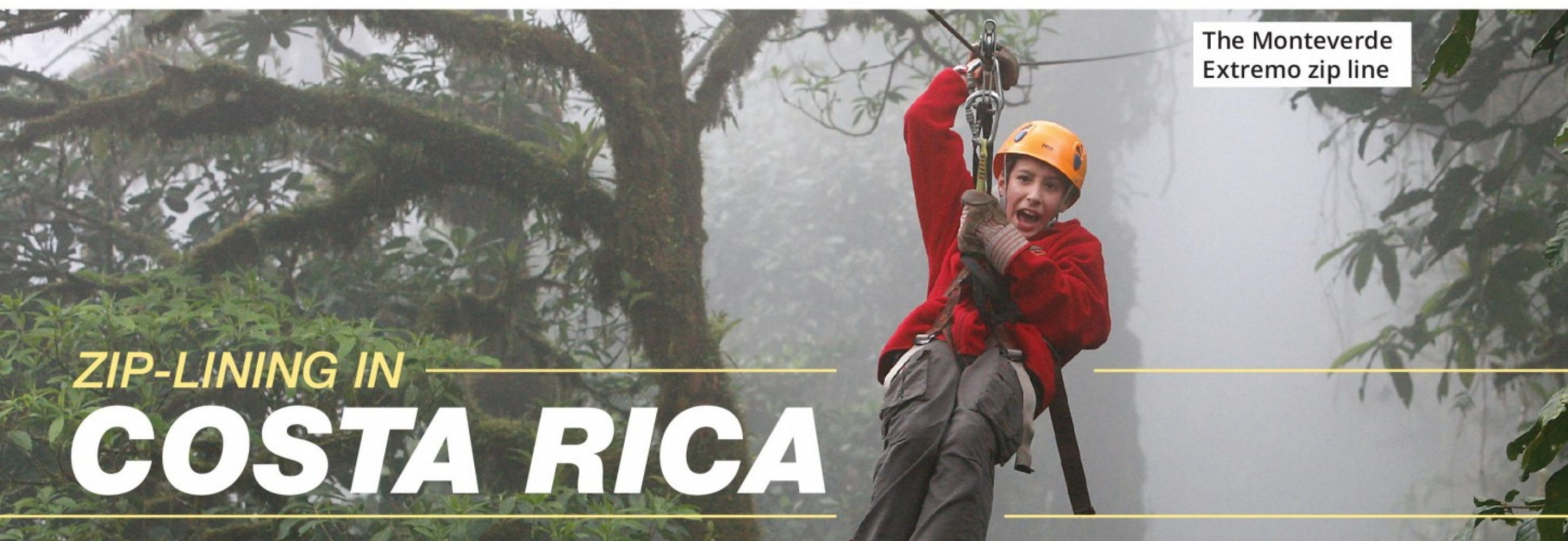
The Monteverde Extremo zip line